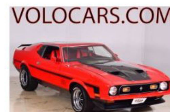
1972 Ford Mustang $26,998