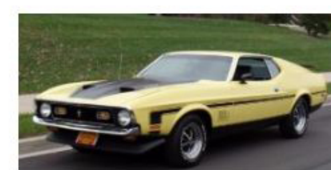
1971 Ford Mustang $39,990