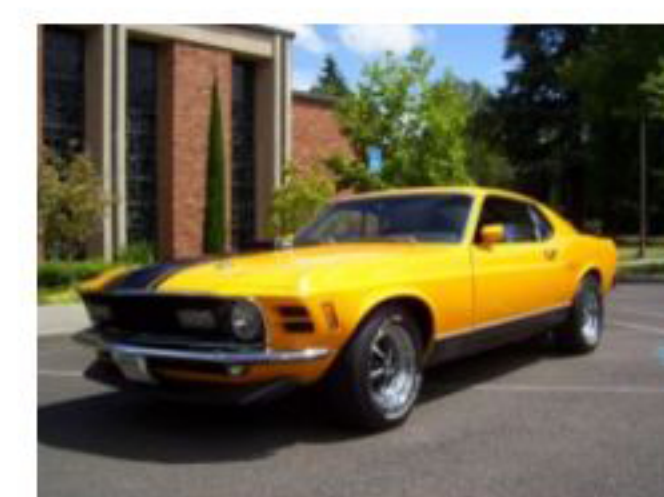
1970 Ford Mustang $49,900