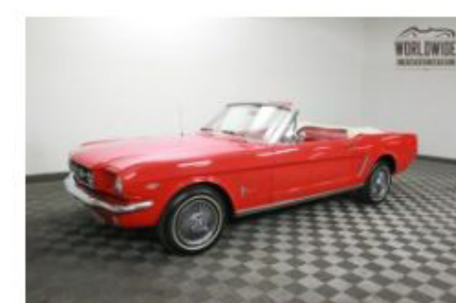
1965 Ford Mustang $22,900