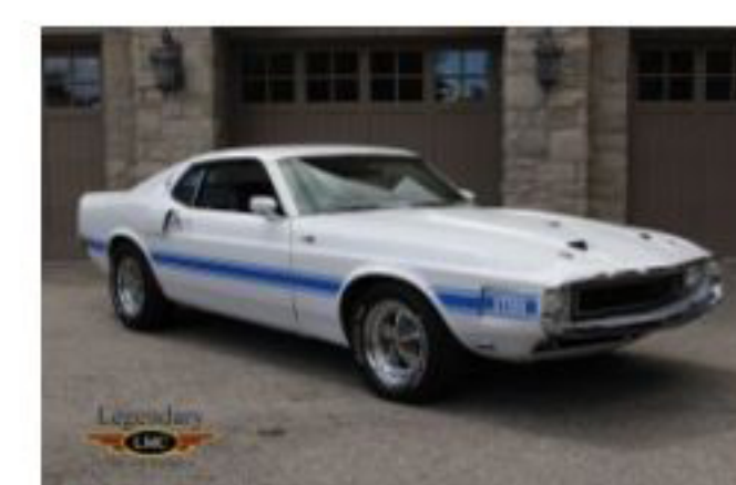
1969 Ford Mustang $79,900