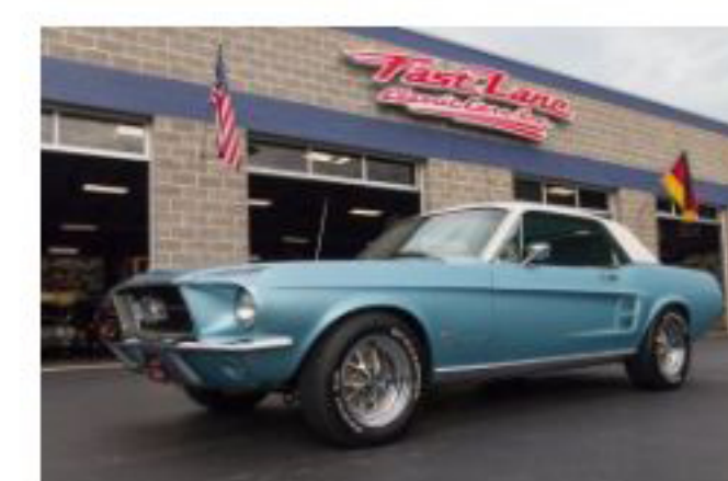
1967 Ford Mustang $34,995