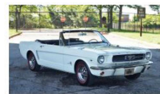
1965 Ford Mustang $28,995