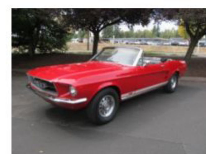
1967 Ford Mustang $35,000