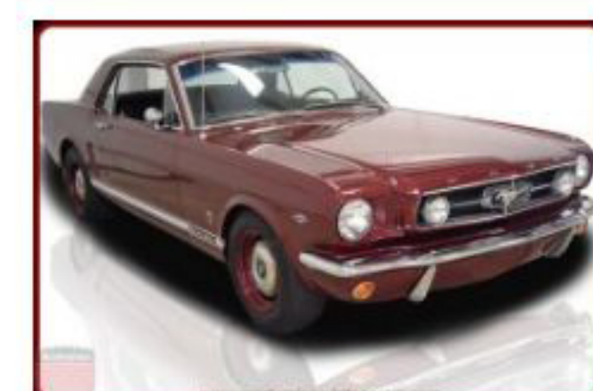
1965 Ford Mustang $39,900