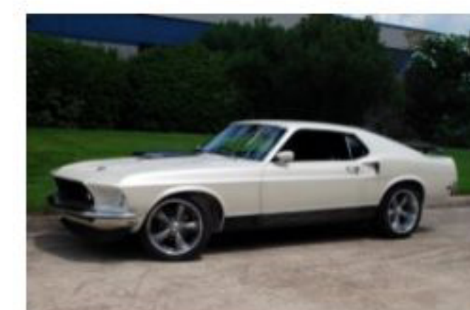
1969 Ford Mustang $52,969